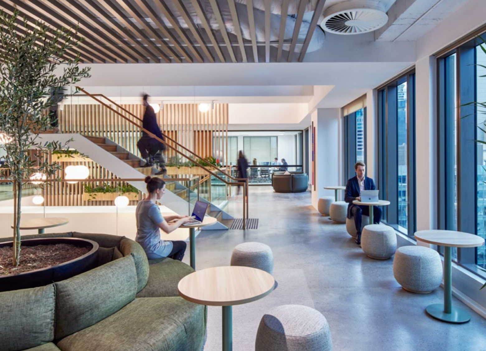
The images in this section 2 are of Charter Hall Group offices, not images of underlying Fund properties.